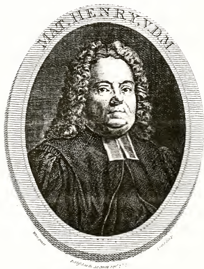
From the original Drawing